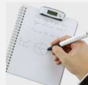
IRIS Notes™ 2