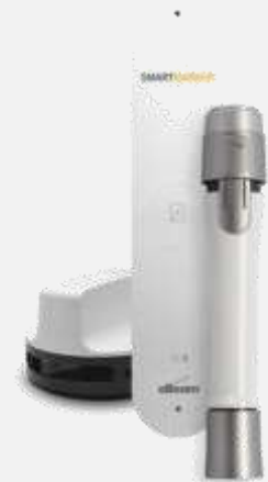
E-Beam Smart Marker