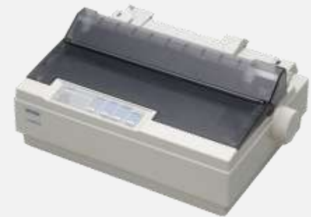
Dot Matrix Printers