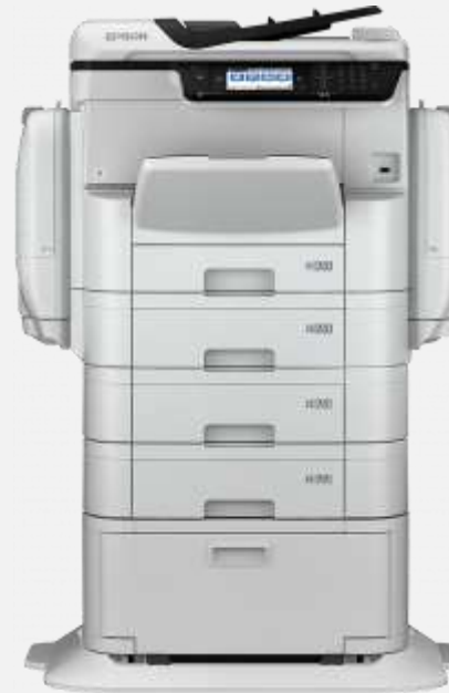
Enterprise business inkjet