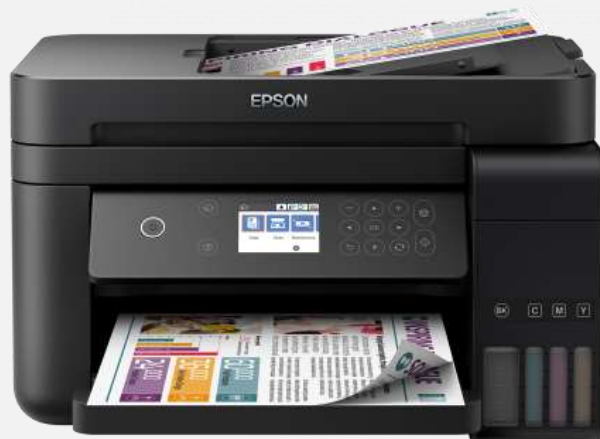
Home & SMB ECOTANK inkjet printers