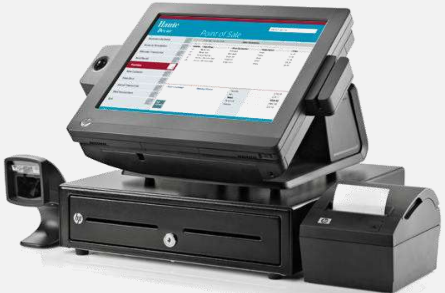
All-in-One POS System