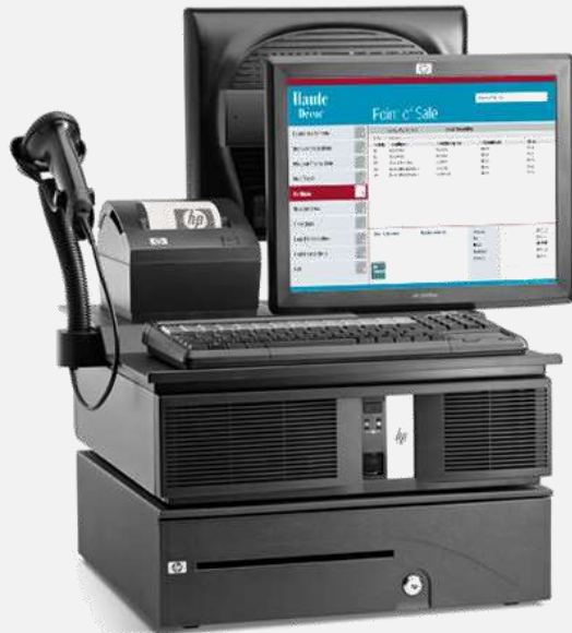
Modular Retail Solution