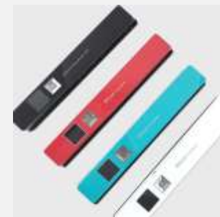
IRISCan Anywhere 5