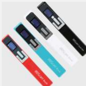
IRISCan Book 5