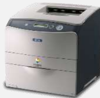
Color & Mono Laser Printers