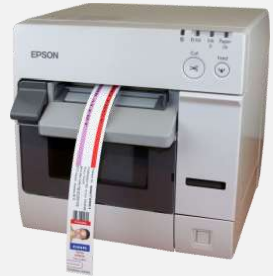
Color Label Printer