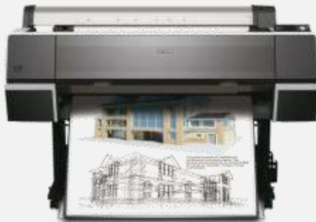
Large Format Printers