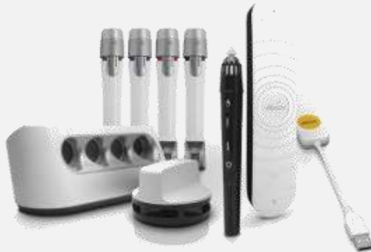
E-Beam Edge+ Complete