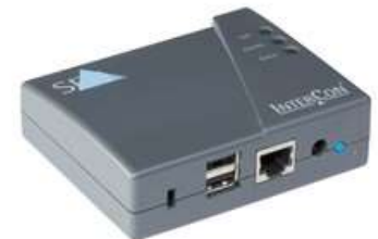
Print Server External