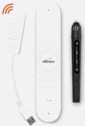
E-Beam Edge +