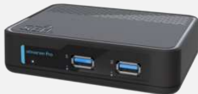
USB Device Servers