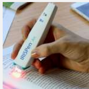
IRIS Pen™ 7